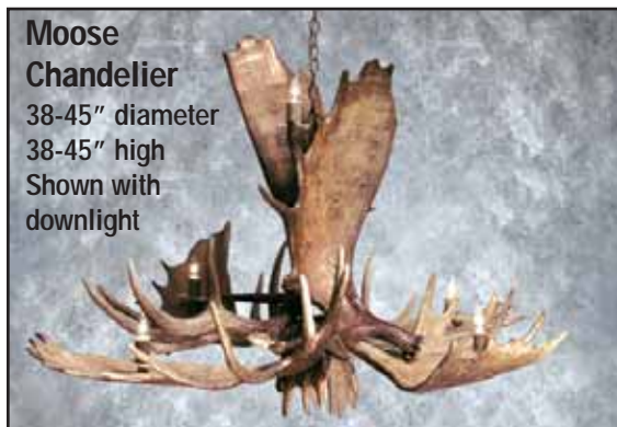
Moose Chandelier 38-45" diameter 38-45" high Shown with downlight

Looking for that one very unique item, to help enhance, complete the elegance and beauty of your home or cottage? Perhaps a special gift to pass on to a loved one or friend. Fine Antler Products can offer all this and more. Each piece is hand built using authentic big game animal sheds. Unlike the vast majority of reproductions you'll see elsewhere! Let us build you your very own, one of a kind, truly breathtaking piece of antler artwork. Call or e-mail for a complete colored catalog or simply visit our website.