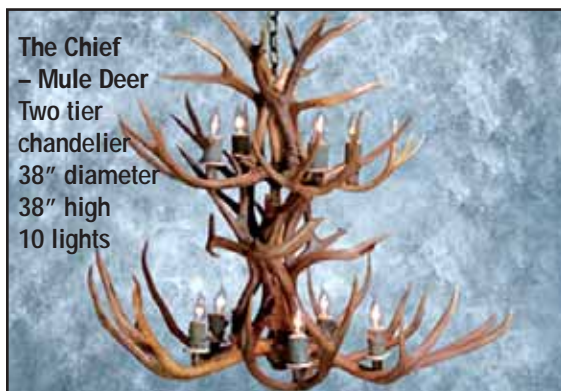
The Chief – Mule Deer Two tier chandelier 38" diameter 38" high 10 lights