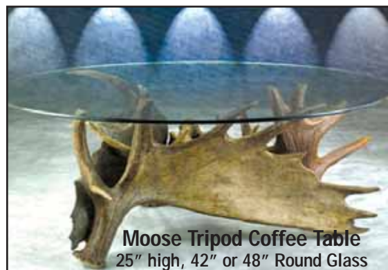
Moose Tripod Coffee Table 25" high, 42" or 48" Round Glass